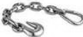
3/8" x 18" CHAIN AND GRAB HOOK ASSEMBLY