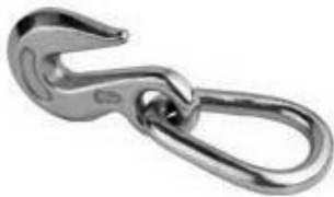
3/8" GRAB HOOK ASSEMBLY