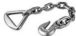
5/16" x 12" OR 18" CHAIN AND GRAB HOOK ASSEMBLY